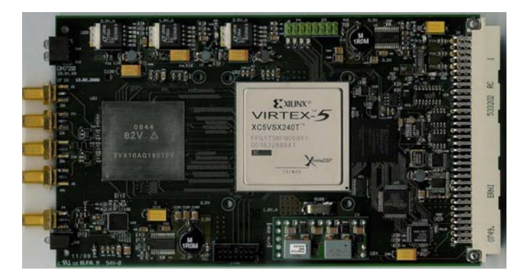
Fig. 3. Currently in lab tests: The new 2.5 GHz bandwidth XFFTS, making use of a first sample of E2V's 5 GS/s 10-bit ADC and the high performance Xilinx Virtex-5 SX240T FPGA.