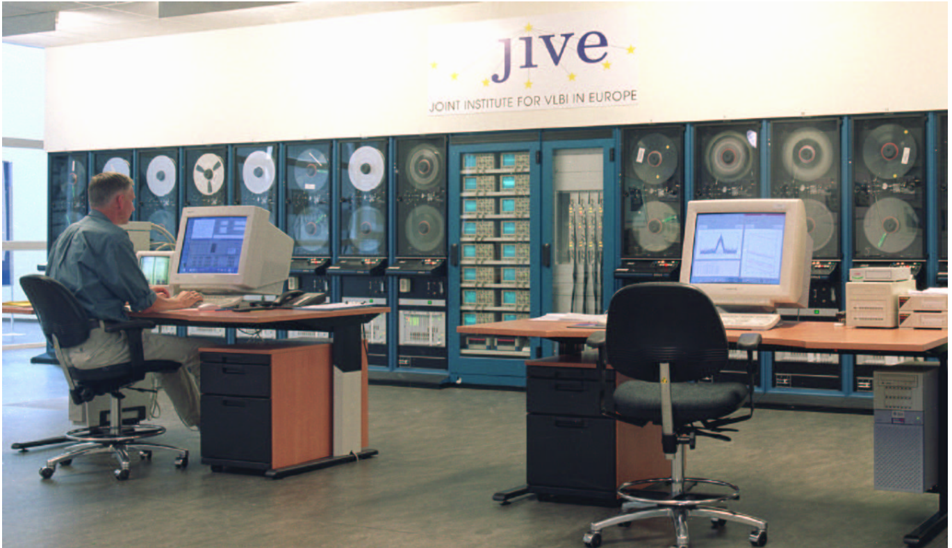
Fig. 1. The EVN MkIV Data Processor at JIVE

ing experiments and tests are processed. The processor is manned for 80 hrs/week, and currently one or two projects per week get finished, despite a fair fraction of time being spent on testing new capabilities and correlation in support of the Network. In the future the throughput will go up; speed-up correlation, in which the tapes play faster than they were recorded, was tested successfully in June 2002.